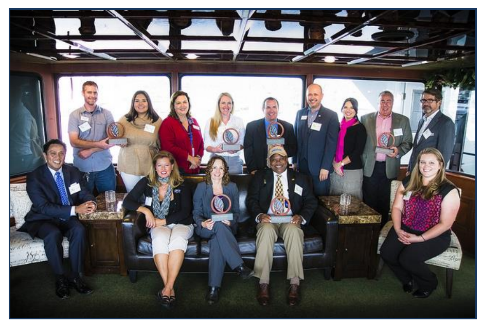
Photo 1. Green Business Network Members recognized at the 2017 Sustainable Achievement Award Ceremony

Along with technical resources, the Network provides Members with marketing support and recognition opportunities to promote sustainable achievements. Short promotional videos are offered to Members at no-cost to showcase various sustainable initiatives implemented by member businesses. The Network publishes the videos on its website and issues press releases to announce the videos; additionally, the Network provides the videos to the business for promotion through their own communication channels. The Network also recognizes Members for their exemplary performance in seven different environmental categories with annual Sustainable Achievement Awards . Winning businesses are honored at a year-end networking event and ceremony that offers Members a chance to learn more about the sustainable achievements of their neighboring businesses.